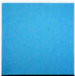
8 ANNE TRUITT Blythe 1998 Acrylic on canvas , 106.5 x 106.5cm (42 x 42in) TRU 9