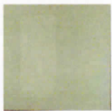
9 ANNE TRUITT Arundel XIV 1975 Acrylic on canvas, 216 x 216 x 4cm (85 x 85 x 1 5/8in) TRU 1